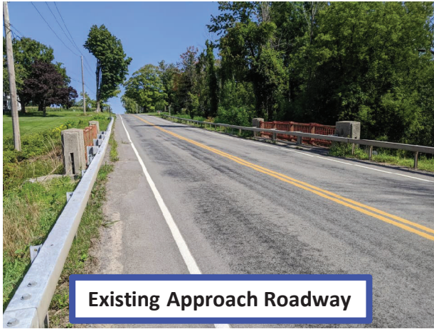
Existing Approach Roadway