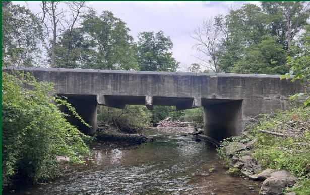
Town of Mendon, Monroe County