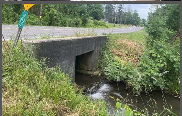
Town of Mendon, Monroe County