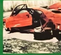
Matt's car post-crash.