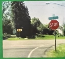
The Lehigh Station Road stop sign where Matt stopped before the crash.