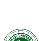
ADAM J. BELLO COUNTY EXECUTIVE

Message from County Executive, Adam J. Bello: Plan Forward will address big, global concepts like sustainability, social equity, energy supply & conservation, and climate change adaptation in ways that are appropriate and unique to Monroe County, while at the same time addressing local challenges like accessibility, economic development, recreation, food accessibility, and transportation.