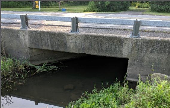
Town of Perinton, Monroe County