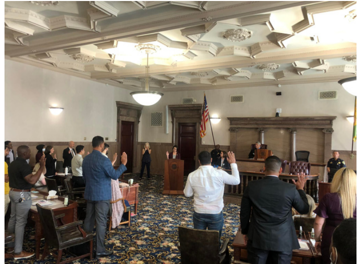
Reciting the Oath of Allegiance at a Naturalization Ceremony