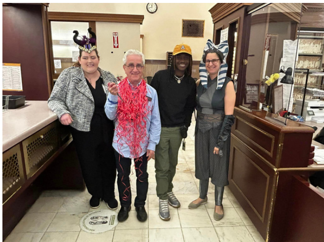
Halloween Fun 2022!