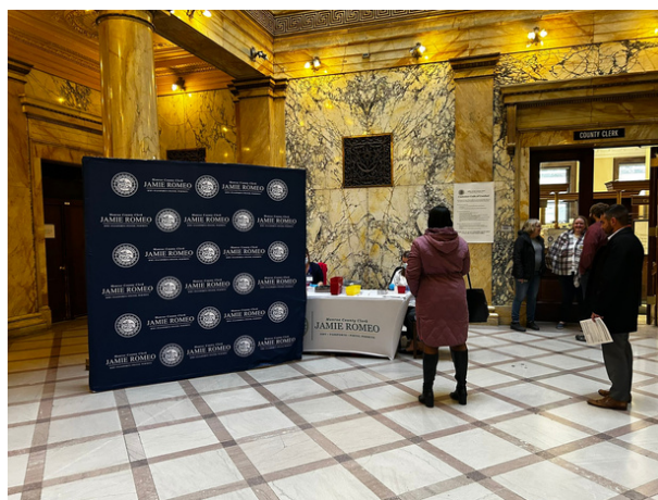
Flu and COVID Booster Clinic