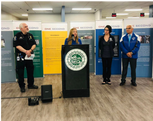
Raising Awareness with Monroe County STOP-DWI

Throughout 2022, all Monroe County DMVs continued to make the most of their close to 500,000 annual transactions by partnering with Monroe County STOP-DWI, New York Donate Life, and Monroe County's first ever PRIDE Committee to help share important information with every person who visited any one of our four locations.