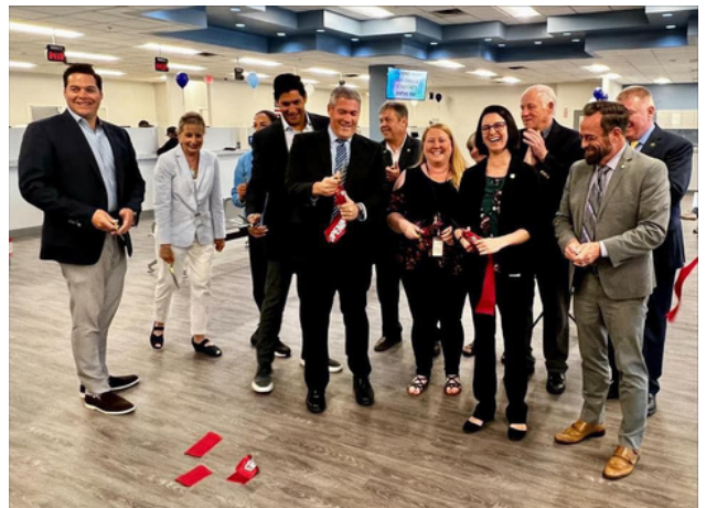
Ribbon Cutting at the new Henrietta DMV Branch