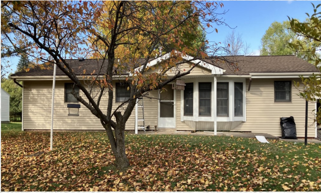
Home Improvement Project