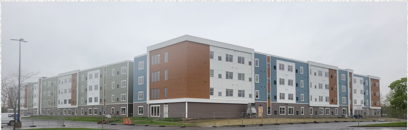
Marketplace Senior Apartments, Henrietta

Public Comment Period: May 3 - June 12, 2024